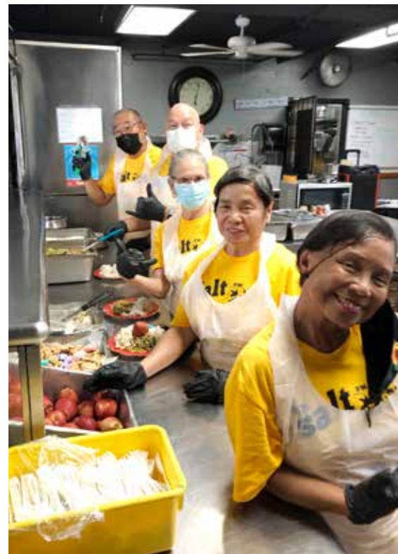
Parishioners of St. John Apostle and Evangelist Church in Mililani volunteer their time and talent at the Institute for Human Services in Iwilei.