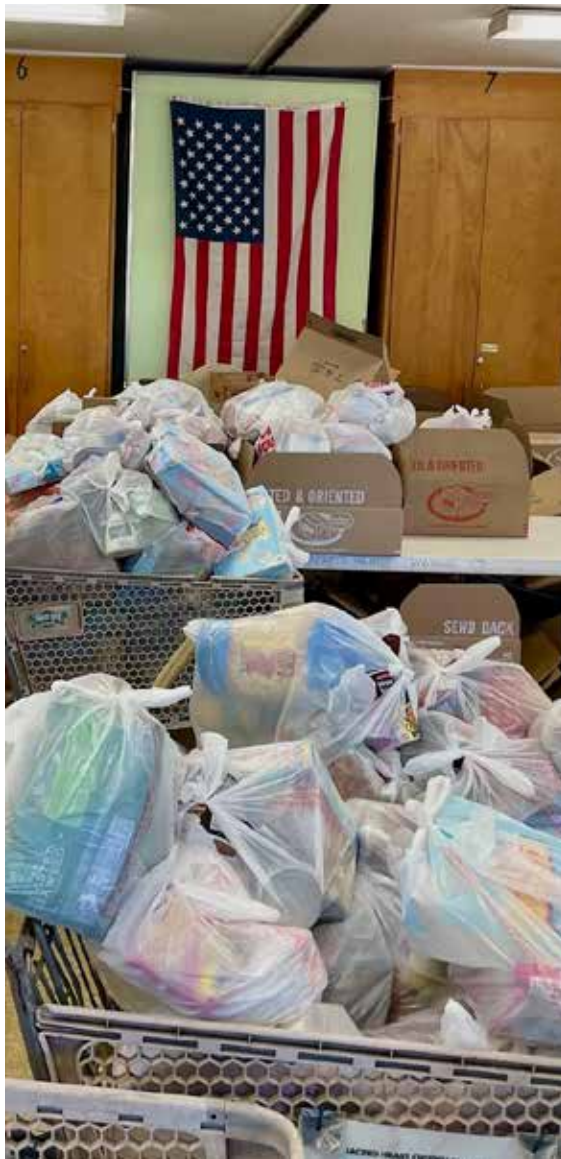
Goods are bagged up for distribution in the food pantry at Sacred Heart Church in Waianae.

Recently, Bishop Larry Silva prioritized a renewed focus on developing stewardship within the diocese and implemented significant struc-