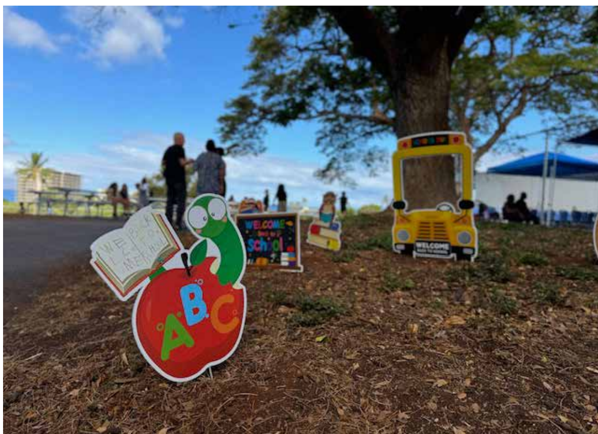
Decals welcome students back to class at Sacred Hearts School's new temporary campus in Kaanapali.