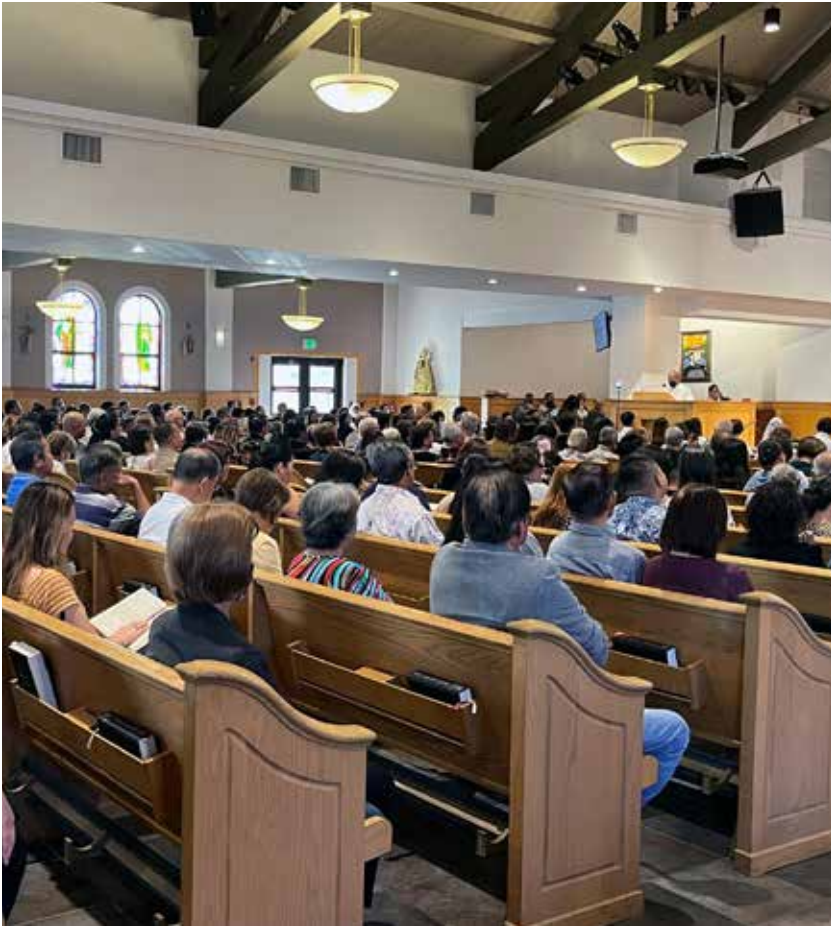
Parishioners attend Mass at St. Joseph Church in Waipahu.