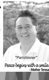
"Parishioner" Peace begins with a smile. - Mother Teresa