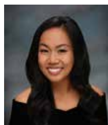
Erin Guerrero School Service Award