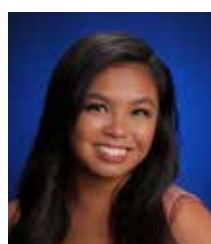
Jaeden Cruz Leadership Award