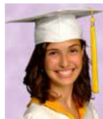
Alana Glaser Theology Award