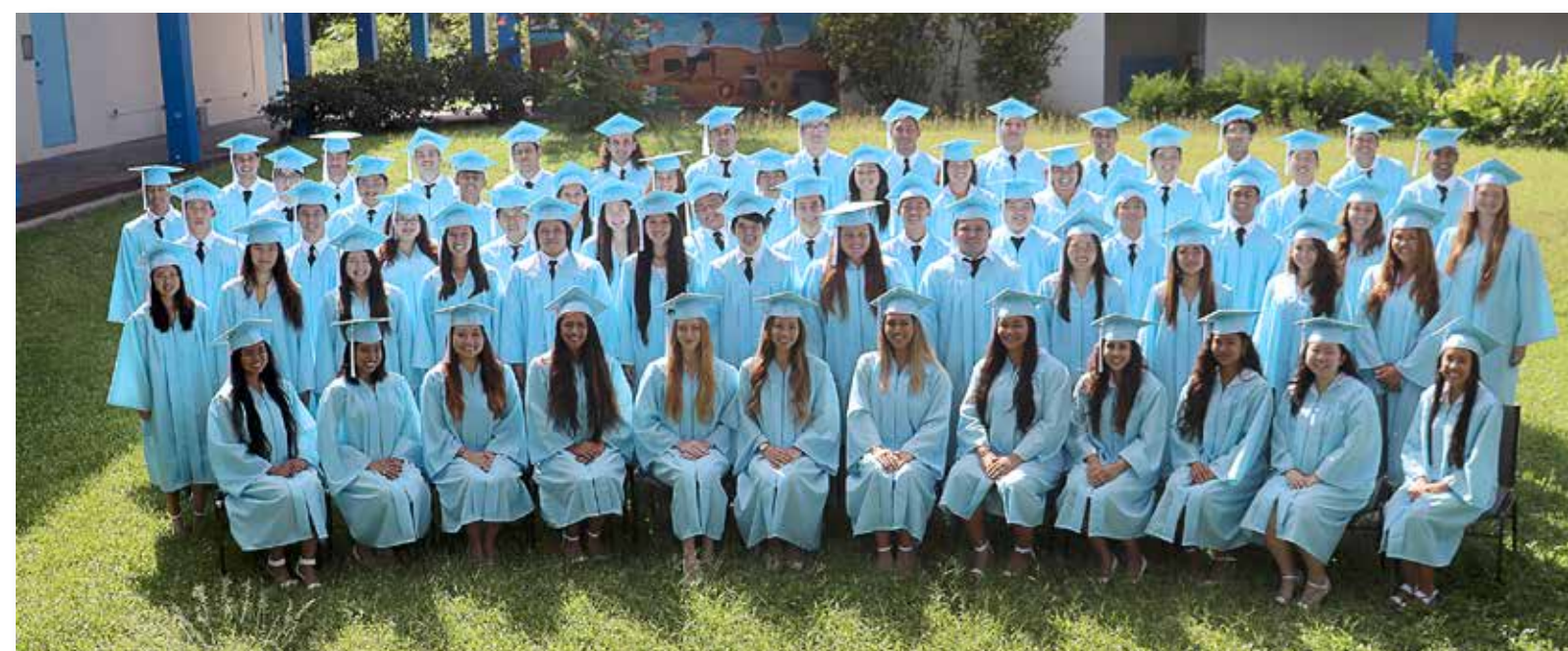
SAINT FRANCIS SCHOOL