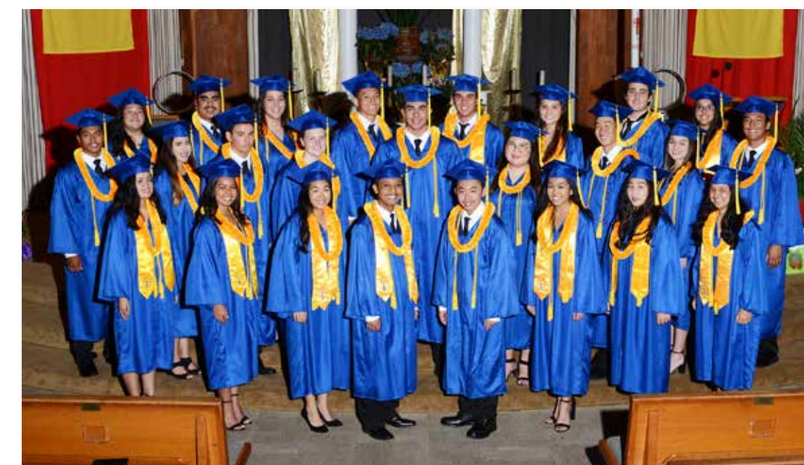
SAINT ANTHONY JR/SR HIGH SCHOOL