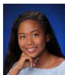
Ciara Ratum Service Award