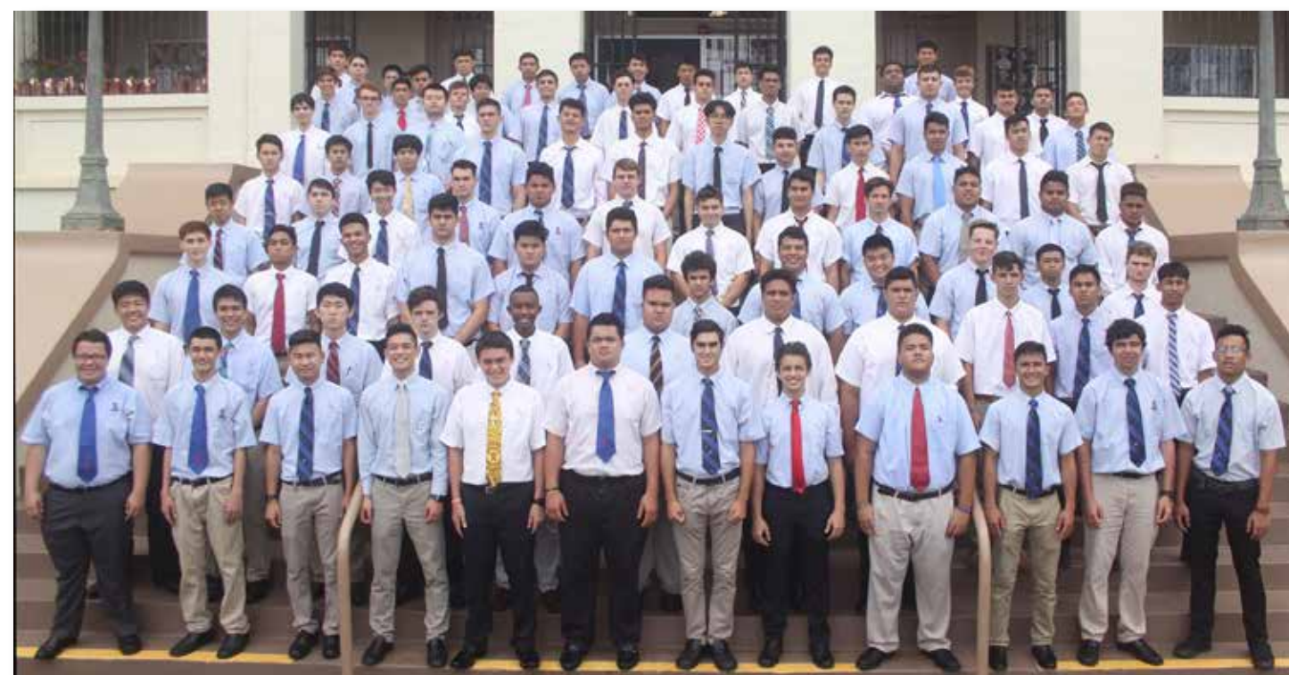
SAINT LOUIS SCHOOL