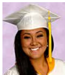
Kimi Tokunaga Aymer Award