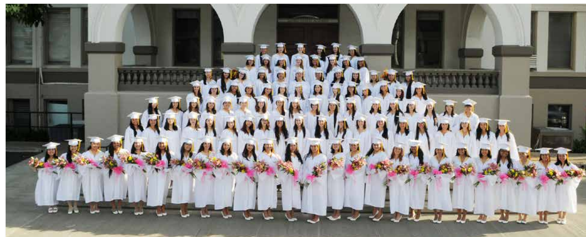
SACRED HEARTS ACADEMY