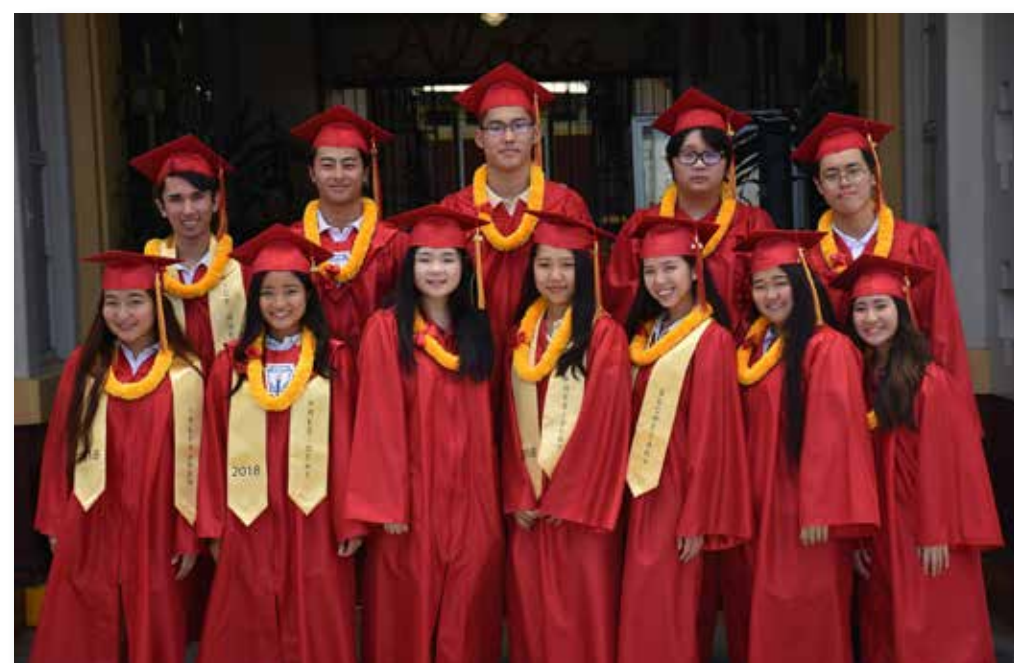
SAINT JOSEPH JR/SR HIGH SCHOOL